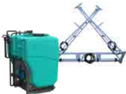
200 gal LAND CHAMP 3PT SPRAYER