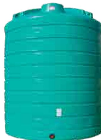
ENDURAPLAS VERTICAL FERTILIZER

COMES WITH FOUR HEFTY BUILT-IN TIE DOWNS