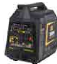
2800 WATT GAS INVERTER