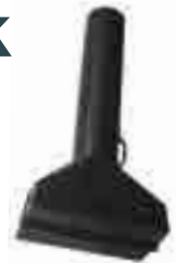
ICE AUGER CASES