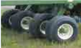
Wishek Hubs, Spindles, Wheels, and Tires