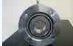
Wishek Bearings and Bearing Stands