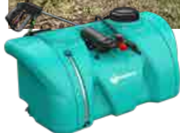
25 gal Enduraplas SPOT CHIEF SPRAYER