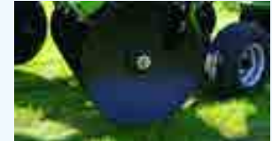
Wishek Discs, Gangs, Spacers, Springs, and Hardware