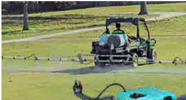
60 USG UTV FIELD BOSS SPRAYER

We have a wide range of sprayers for all your chemical spraying needs.