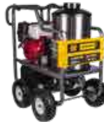
GX390 HONDA 330,000 BTU 389 CC 4000 PSI 4.0 GPM

ELECTRIC POWEREASE 2000 PSI 1.76 GPM GX200 HONDA 330,000 BTU 2700 PSI 2.7 GPM GX390 HONDA 390CC 4000 PSI 4.0 GPM GX390 HONDA 330,000 BTU 389CC 4000 PSI 4.0 GPM 225CC POWEREASE 3100 PSI 2.5 GPM 420CC POWEREASE 4000 PSI 4.0 GPM