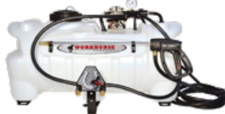
25 GAL WORKHORSE ATV SPRAYER