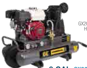
GX200 8 GAL HONDA