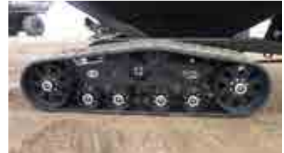
Grain Cart Tracks