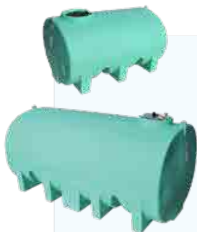
HORIZONTAL LEG TANK

● WATTP45276 180"L X 96"W X 85"H ○ WATTP45272 180"L X 96"W X 85"H