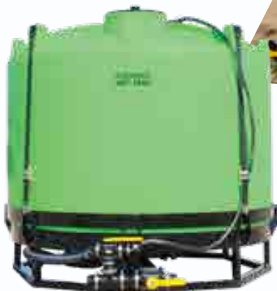
CHEMBINE HOT TANK 1680 US GAL