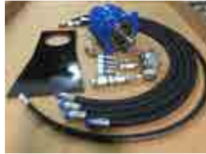
Hydraulic Drive Kits