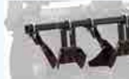
Wishek Blade Scrapers and U-Bolts