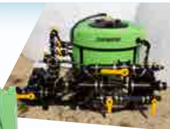
CHEMBINE MIXER 75 US GAL