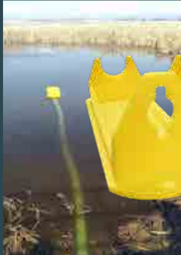
FILTER FLOAT FOR SUPER FLO 2" SANDSCREEN

Filter floats utilize either a sand screen or super flow filter, and come in 2 sizes.